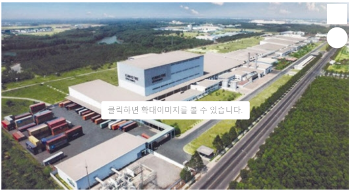
Kumho Tire's plant in Vietnam